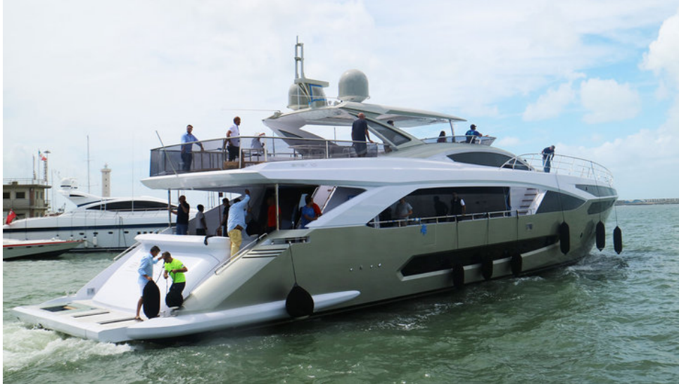
The Amer Unique is a bespoke 110ft yacht, powered by Volvo Penta IPS.

Luxury boat-builder Amer Yachts has created an exclusive superyacht of 110 feet – the largest ever to be powered by Volvo Penta's Inboard Performance System (IPS).